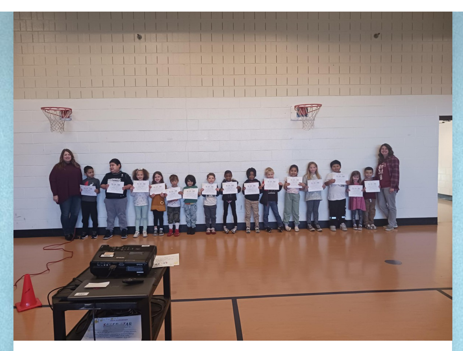
Grades 3-5 Caln OWLstanding Students - November